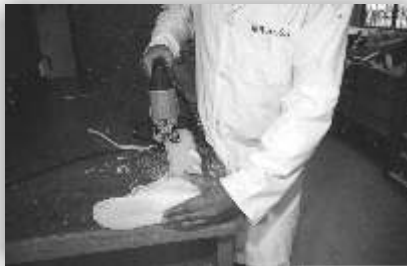
Cutting according to the trimlines