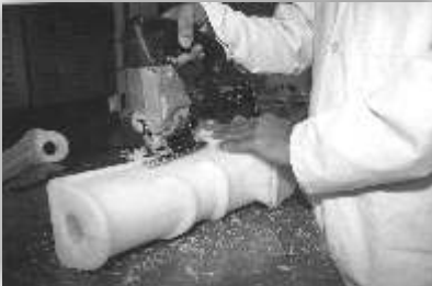
Cutting front portion of shell

Initial fitting : Take shells from selected size kit and cut the front portion using Jigsaw. Take initial trial to mark trim lines and cut accordingly. Finally cut the shell for 95° knee movements.