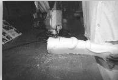
Cut the Shell for 95° knee movement

Note : In case lower shell is not fitting due to fixed deformity in foot, make AFO part custom made and use upper shell prefabricated.