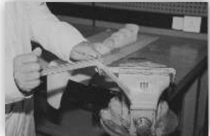
Bending aluminum bar

Height compensation- Use rubber sole to give height compensation from inside upto 12mm and outside upto 60mm if required.