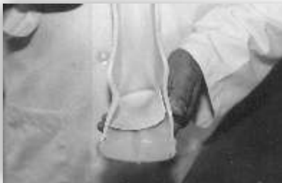
Inside height compensation

Trial- Take a trial and check for out any alignment problem, If any realignment is required correct it by unscrewing the screw. Give the required gait training and do the necessary check out (See annexure-2).