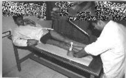
Tracing the affected knee