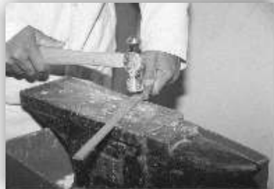
Fixing bar and joint