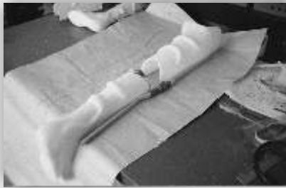
Align the joint bar assembly with shell

Alignment- Use tracing to do alignment and match the aluminum bar with contour of plastic shell. Initially use 3mm-screw nuts to fasten bar and straps with plastic shell