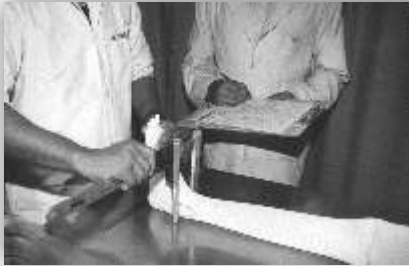
Taking medio-lateral width of Ankle

Measurement and tracing : Take medio-lateral width and height measurement at different landmark mentioned in the measurement form (see Annexure-1). Finally trace the affected limb on brown paper, which helps in alignment.