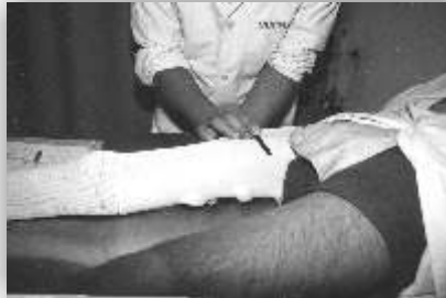
Marking trim line