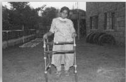
Trial in walker

Final finishing- Make holes in plastic for ventilation, rivet the bar with plastic shell using 3mm copper rivet. Fasten the straps with plastic shell using press button provided in the kit.