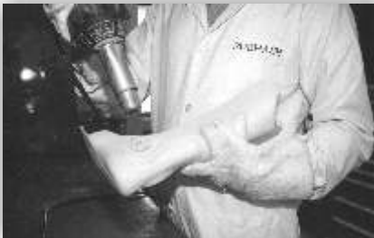
Local heating for modification

Fixing bar and joint: - Fix the bar with joint and rivet it with 3mm copper rivet provided in the kit.