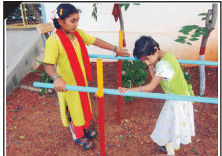
Therapy set up using local resources