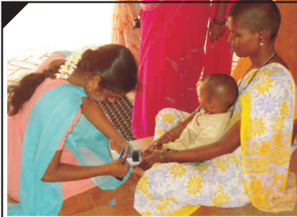
Quality rehabilitation reaching rural areas

Through its mobile workshop, services are made available over large distances and definite changes ensured in the persons life.