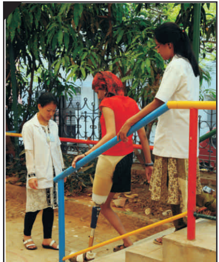
New Limb, New Life

Available to a large number of people with a wide choice suiting lifestyle, comfort, affordability and local accessibility along with therapeutic intervention and surgical referrals to prevent or correct deformities.