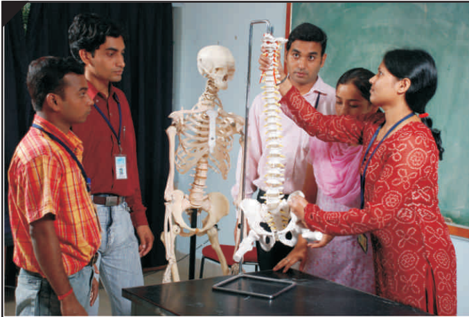
Theory Session in body systems

Conducts courses to develop appropriate rehabilitation personnel to provide prosthetics, orthotics, wheelchair & therapy services and promote community based rehabilitation