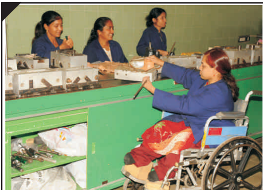
Jaipur Foot Production Unit

The products are now being used in India, Sri Lanka, Bangladesh, Nepal, Ethiopia, Mozambique, Rwanda, Cambodia, Vietnam, Afghanistan & Nigeria.