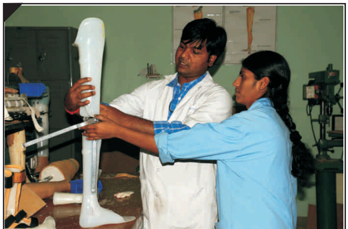
Practical Session in assembling orthoses

Conducts courses to develop appropriate rehabilitation personnel to provide prosthetics, orthotics, wheelchair & therapy services and promote community based rehabilitation