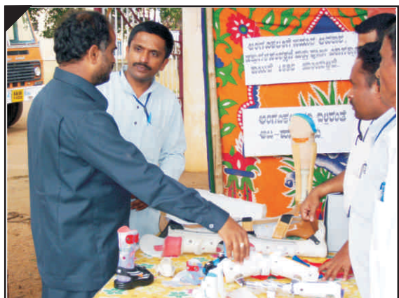
Importance of assistive devices in rehabilitation