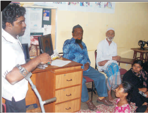
Creating awareness about disability issues