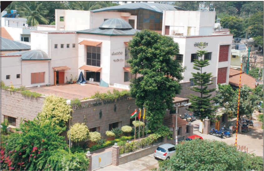
Mobility India Rehabilitation Research & Training Centre, Bangalore

Mobility India's Rehabilitation Research and Training Centre in Bangalore, a model of disability friendliness, houses all its activities. Regional Resource Centre in Kolkata was established in 1998. The organisation has a perfect blend of disability and non-disability at all levels - an innovative organisation of abilities and commitment in its approach to address the real need.