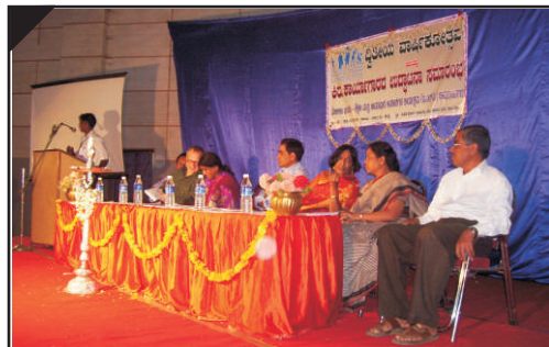
2nd Anniversary programme at Chamrajnagar